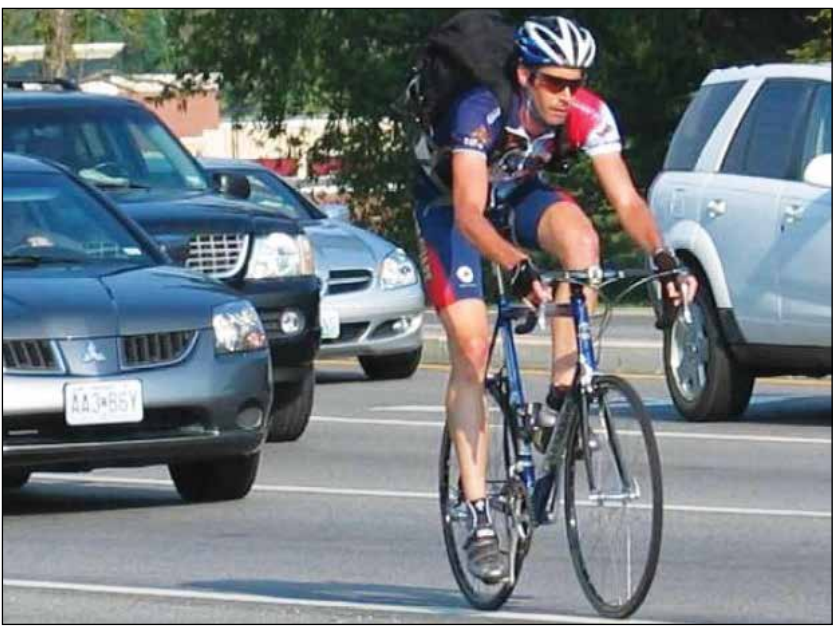
Mutual courtesy enables bikes and autos to share the roads of Chesterfield

of the plan included substantial public involvement and coordination with City residents, St. Louis County, and