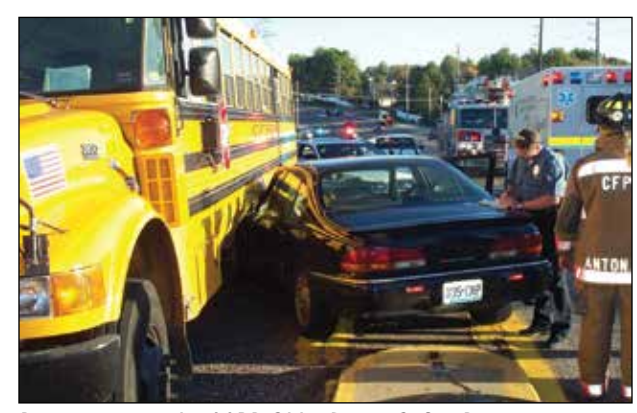
Participation in the AARP Older Driver Safety Program can help keep motorists from being in situations such as the above.

The course will be held on Wednesday, April 10, from 9 a.m.-1 p.m. at Chesterfield City Hall. Reservations are required.