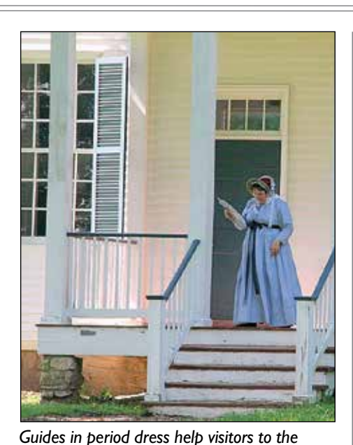
Thornhill Estate on Mother's Day weekend. picnic shelter with a capacity of 150. It is located close to parking, the playground and rest rooms and near the entrance to

located close to parking, the playground and rest rooms and near the entrance to the Historic Village. The Butterfly House and St. Louis Carousel also are close by. Rental is $125 per day – for reservations, call 314.615.4386.