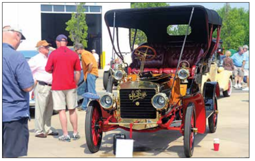
This classic automobile was one of the stars of a previous Concours d'Elegance.

More than 70 vehicles are chosen for the show and appear in special and traditional classes. These include Duesenberg, Packard, Ferrari, Mercedes-Benz, Rolls-Royce, and Jaguar, along with lesser known vintages. Emphasis is often placed on auto-