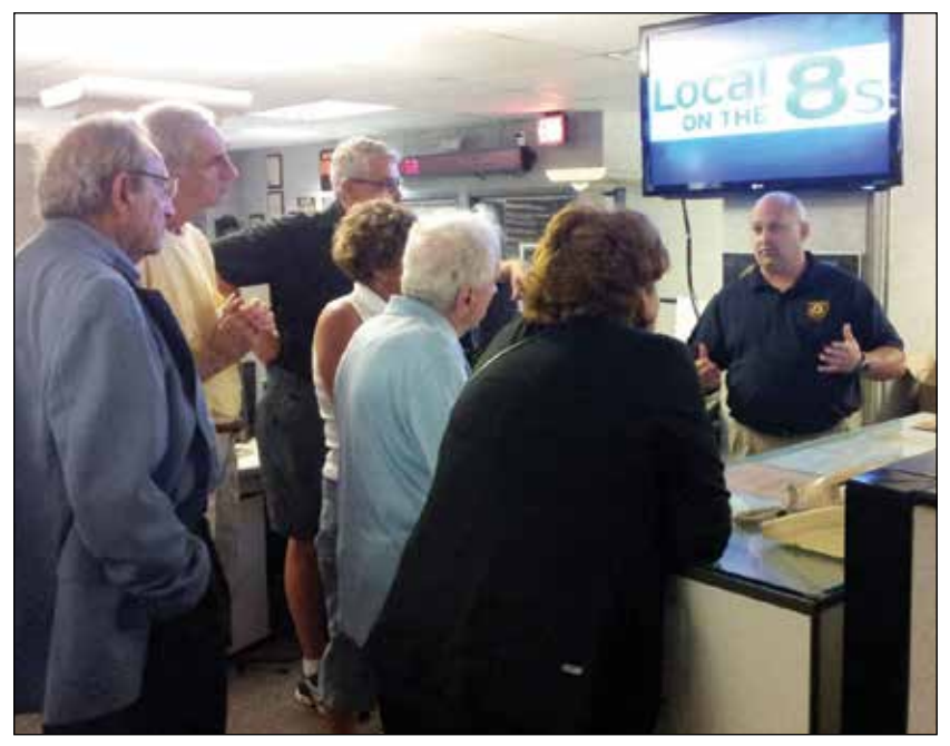
A County police officer at St. Louis County Communications explains to Chesterfield Citizen Police Academy participants about policies and operations.

This session will begin on Monday, May 13, and will meet once a week from 7-9 p.m. for nine weeks. The academy is open to any person 21 years or older. Classes will meet at the Chesterfield Police Department, 690 Chesterfield Parkway West.