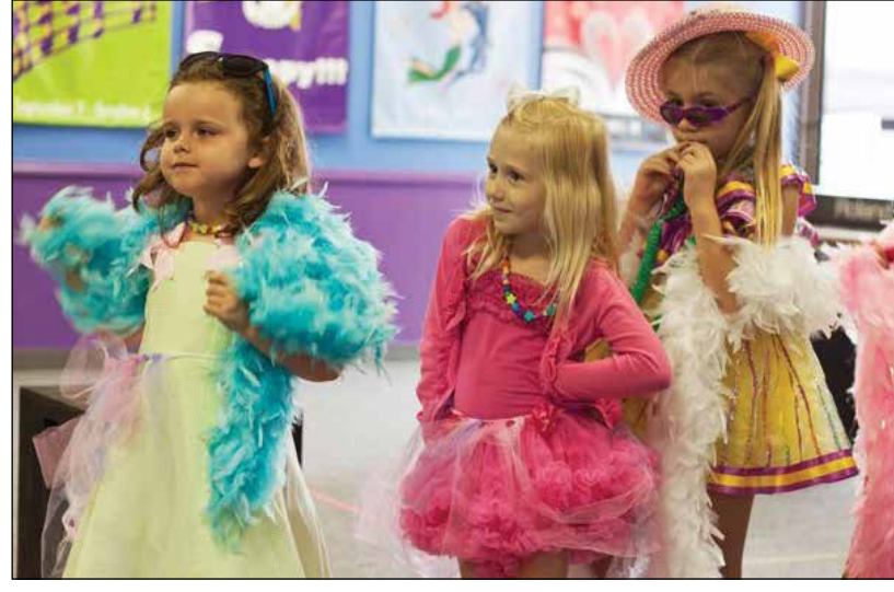
Performers from the younger side of the Academy put their acting skills on display.